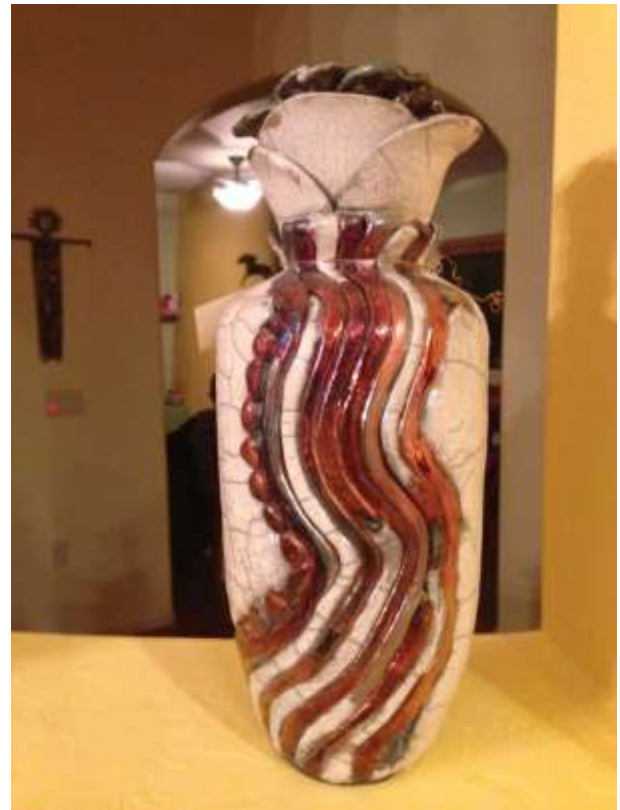
Raku ~ White Crackle and Purple Passion