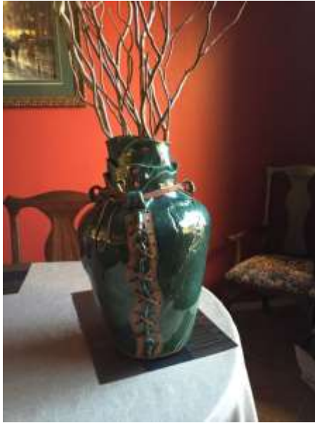
High Fire - Sage Green