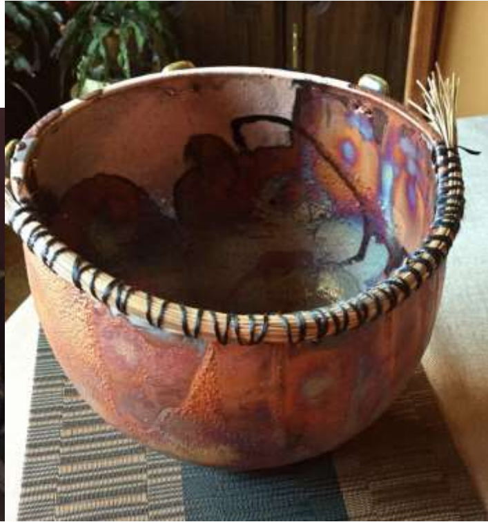
. Raku -Purple Passion with pine and needles