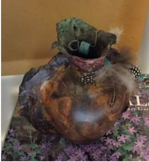
Sagger Fire, above