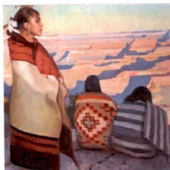
Paintings with Navajo Rugs