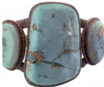
Old Pawn Indian jewelry