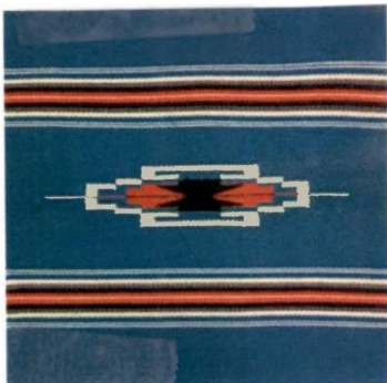
Weavings & Saltillos