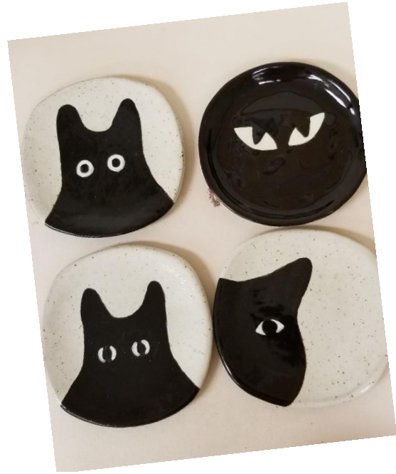
Sally Richards made these cat plates to donate to PAWS for their sale at next year's Art In The Park.