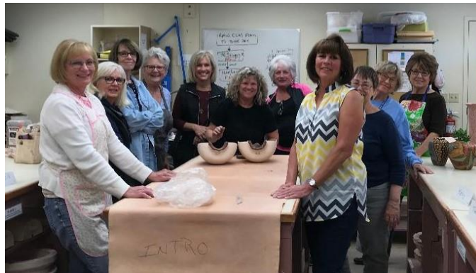
February Intro Class