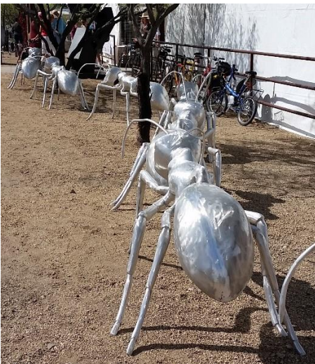
To the Picnic

Lunch will be at PF Chang's restaurant, 1805 East River Road, (520) 615-8788, at 11:30 AM .