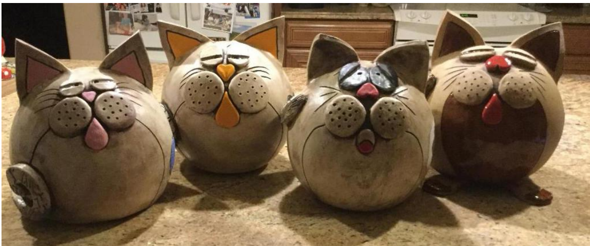
Four cat heads.