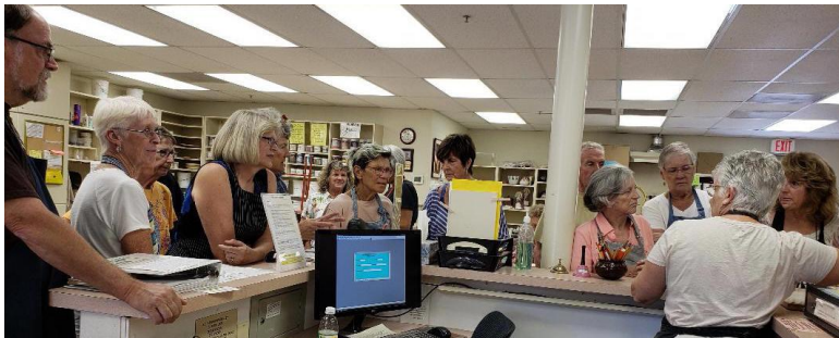
September Intro classes learning at the monitor's desk

Have your pieces in the holding room and enter the patio through the back outside door by 8:30 am.