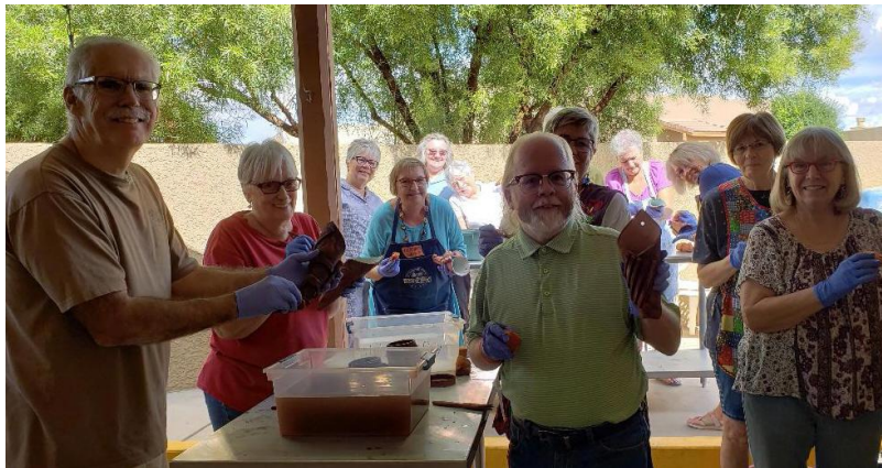
October Intro class learning oxide on the patio